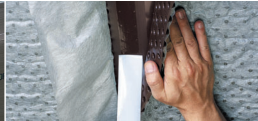
"Wallpapered" straight off the roll.